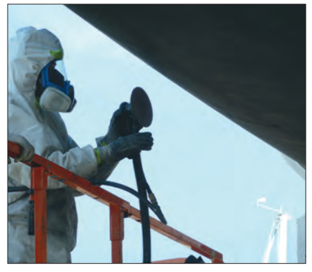
-Years of experience has led KKMI to conclude that for sanding, vacuum sanders and tarping are a better solution

to trap particles and meet air emission standards than wet-sanding, which requires disposal of an even larger mess of contaminated water. Right—An open-topped shipping container covered in clear plastic serves as a reasonably priced spray booth with good ambient light and no risk of explosion from electric lights.