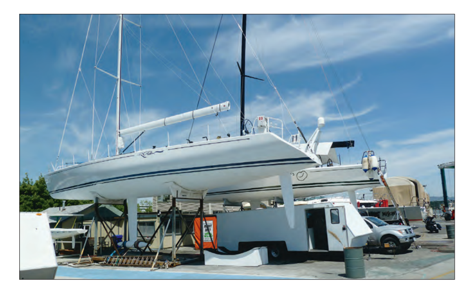
Due in part to the 25' (7.6m) dredged depth along much of KKMI's Point Richmond waterfront, the company got an early reputation as a service yard for large racing sailboats and other deep-draft vessels when the facility opened in 1996.

cited as determining factors in the relocation of some large boat manufacturers to South Africa and China, or the out-sourcing of construction and maintenance to yards in Central and South America.