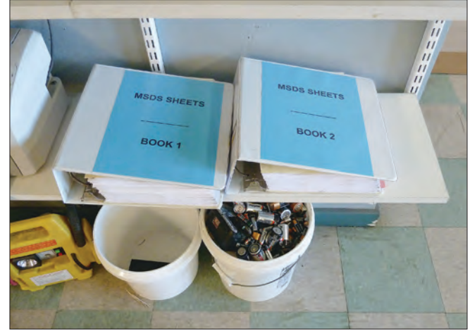
Proper disposal of all materials and recycling where possible are standard practices at KKMI. Left—Paint cans and lids are allowed to dry before being compacted and sent for recycling. Right—Plastic buckets in the yard store collect the spent batteries that workers come in to replace. Just inside the doors, also note the binders of MSDS (material safety data sheets) for all potentially harmful substances stocked in the store.