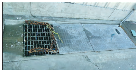
Pressure-washing boats is always done on the bespoke concrete pad that drains all water and suspended solids to this three-chamber settling weir. Most larger solids, such as marine growth, are caught in the chain (usually arrayed on the concrete to the left of the grate) or in the grate proper. Smaller solids settle out in the weir before wastewater is run through an electrocoagulation treatment system.

through an underground pipe to the electro-coagulation treatment system housed in a shipping container on