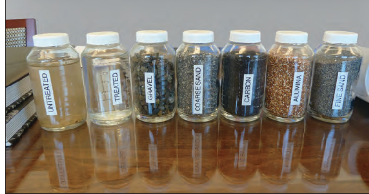
Left —Storm water from the entire 68,000-sq-ft (6,317m<sup>2</sup>) Sausalito yard ends up in this 1,000-gallon (3,785-l) settling tank, affectionately referred to as "the wishing well." From there, three pumps of varying capacities pump it up to a rooftop Aquip system from StormwaterRX (Portland, Oregon), capable of filtering 110 gal (416.4 l) per minute. Right —Samples of treated and untreated water and the five filter media in the Aquip filter tank. Treated stormwater can be discharged directly into the bay.

tank, and the filter-bed material must be replaced annually. Storm water from the Aquip system is clean enough to be discharged into the bay.