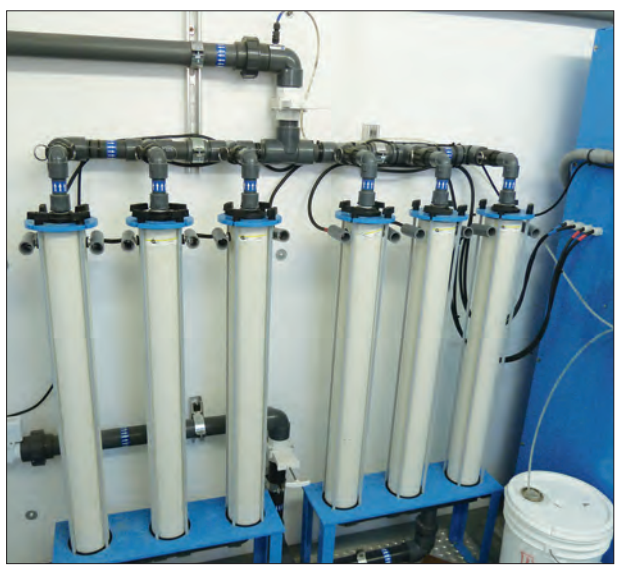
The ElectroPulse system from OilTrap Environmental (Tumwater, Washington) is wired to a central control panel (left). It adjusts the pH of the wastewater before sending it through a series of 4"-diameter (102mm) tubes fitted with electrically charged plates (right) that change the polarity of any suspended solids, causing them to cluster and float, and rendering any metals inert through oxidization.

difficulty hitting the conductivity benchmark, because seawater intrudes into the system through an underground